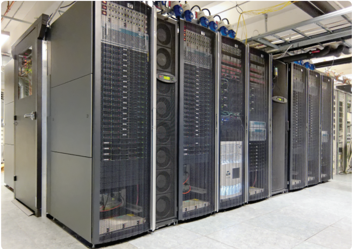
Complete system designed and built by Starfish Technologies

The system receives schedules and Ad sales information from TV4 and interfaces directly to the main channel broadcast automation system and the TV4 News room system. It incorporates a fully redundant architecture with automated failover.